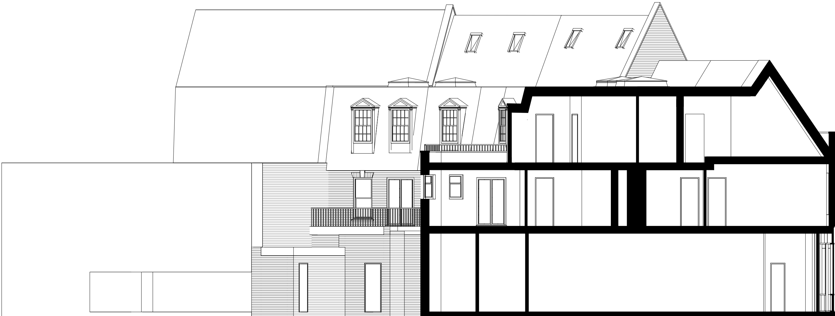
Section A-A 1 : 100